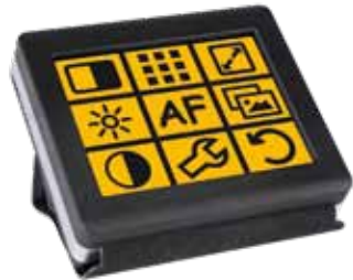
MANO touch 4