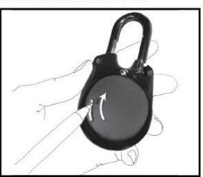
2. On the back of the lock, use a pointed object to slide the reset lever into the "up" position (toward the "R").